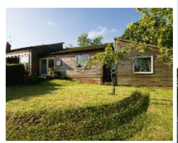
An established garden The garden (ABOVE) reveals the sloping gradient of the site, and is landscaped accordingly; the main living room can be opened up to it through a series of sliding doors (RIGHT)

the cupboard – a family heirloom – which was originally designed to be built into a wall and had been somewhat hidden in a dark corner of the old house. There is storage beneath the staircase, and at the point you pass beneath it to reach the kitchen from the dining area, there are further built-in units.