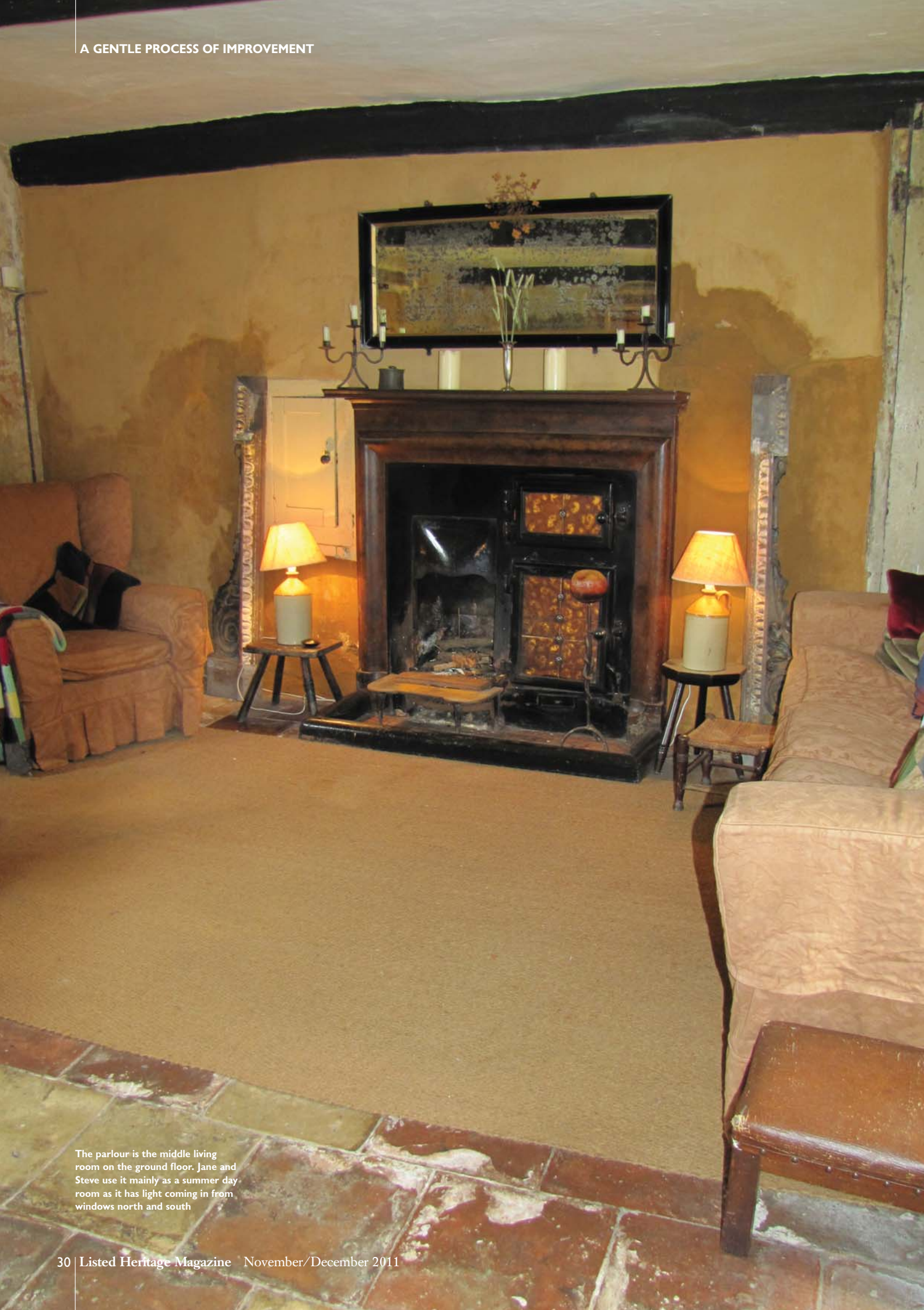
The parlour is the middle living room on the ground floor. Jane and Steve use it mainly as a summer day room as it has light coming in from windows north and south