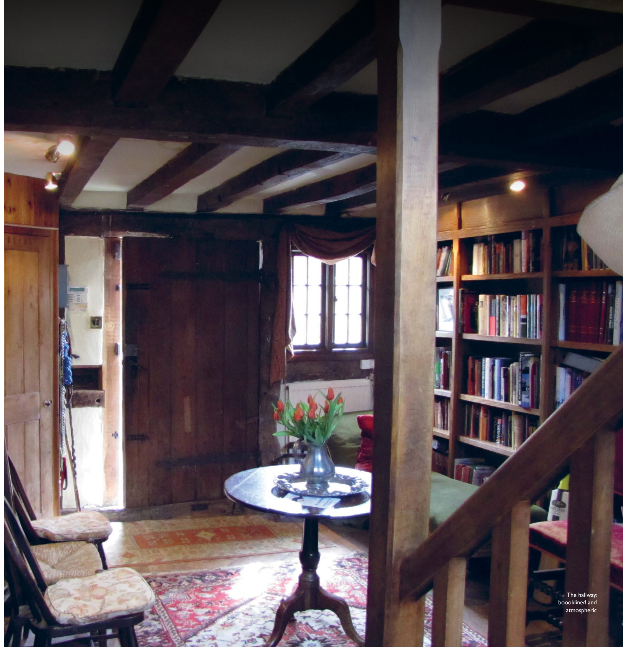
The hallway: booklined and atmospheric